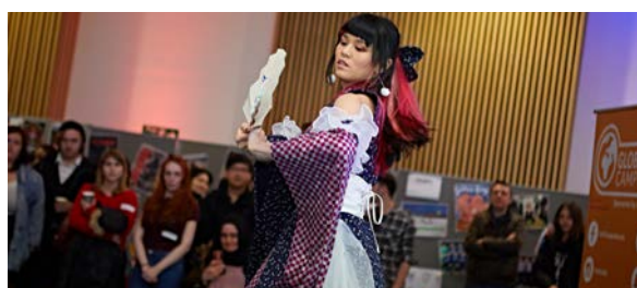
Japanese and Korean Festival