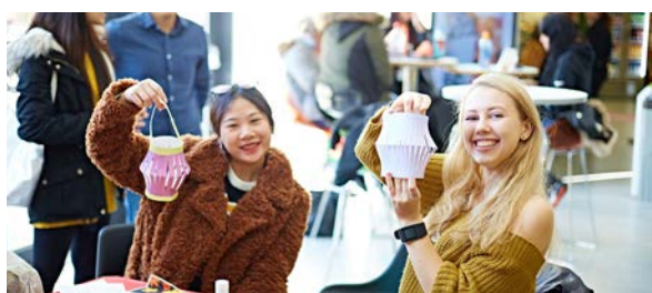
Cultural Exchange Day