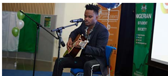
Nigerian Independence Day