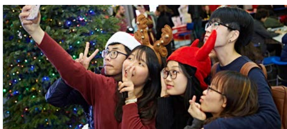
Christmas around the World